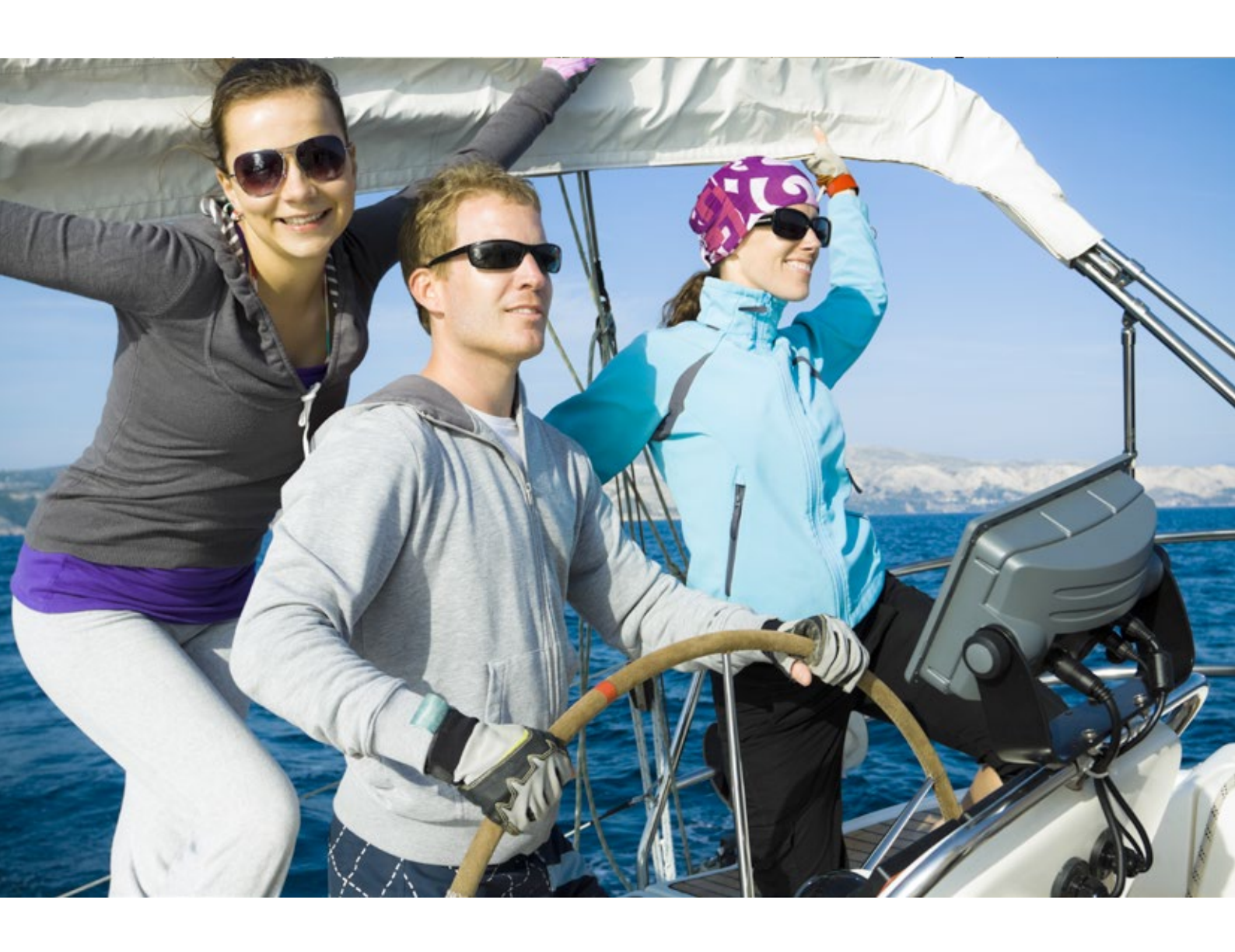
Day 1: Rogač, Šolta island